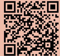
Scan for application

Applications must be received in the Central Mississippi Planning Development District (CMPDD) office or postmarked no later than Friday, January 31, 2020.