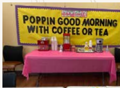
West Side Cafe'

For more information, please contact Lesley Callender at 601-321-2152.