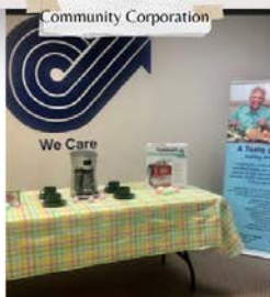
Clinton Christian Community Corporation