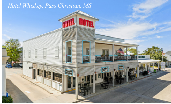
Hotel Whiskey, Pass Christian, MS