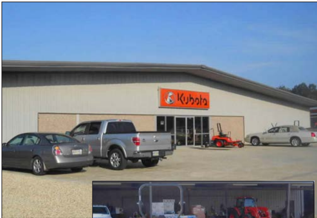
CMDC funds helped Patrick Tractor Co. to create 4 jobs & save 17 jobs in Poplarville, MS.