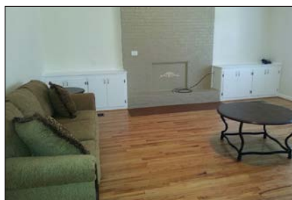
Rooms in disabled client's new home