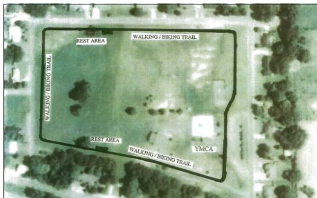
Planned route of walking/biking trail in D. L. Everett Park

The City of Magee is proposing to construct a walking/biking trail that will be located in the R. L. Everett Park. The park, which is named for its donor who is now deceased, is owned by the City and contains 16 acres of property in a beautiful residential area of the City. For the past 24 years this park site has been utilized as a YMCA. In 2011, the YMCA closed their operations and the City assumed some of their programs and full use of the site. This park site contains large open space areas, a functional swimming pool, and a large multipurpose building with two parking areas. The property is accessible from residential areas of the City and from Highway 28 East. The RTP funds will be used to construct a 10 foot wide, ½ mile long multi-use trail along the perimeter of the property with two rest areas, landscaping, and solar lighting. The swimming pool and the multipurpose building will enhance the trail and the restrooms in the multipurpose building will be made available for those using the trail. Magee does not have a facility of this nature in the community and this project will greatly enhance the ability to improve the quality of life for the citizens. The history of the 16 acre parcel of land is unique in that it was donated to