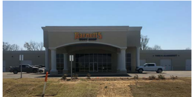
The SBA 504 loan program was used to assist in financing the Barnett’s Body Shop project in Gluckstadt, MS. It was used to construct and equip the new facility, and will create 25 new jobs.

Also, CMDC serves as the Loan Review Board for the Central Mississippi Planning and Development District’s Minority Business Enterprise Loan Program (MBELP). The MBELP receives its funding from the Mississippi Development Authority (MDA). The interest rate on loans made through this program to a minority owned business is currently 5.00% per annum. The term of a loan can be up to 15 years depending on the use of the loan proceeds (commercial buildings, equipment, inventory, working capital, etc.)