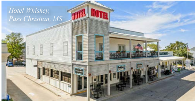
Hotel Whiskey, Pass Christian, MS

CMDC is pleased to announce the continued construction of the Hotel Whiskey project in Long Beach, MS. The project utilized the SBA 504 loan program. The project will create five (5) new jobs in the private sector.